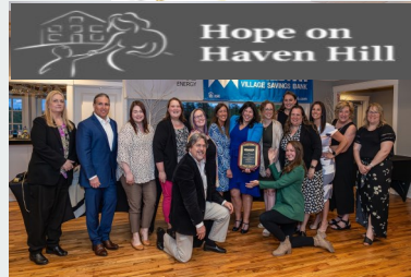
Hope on Haven Hill