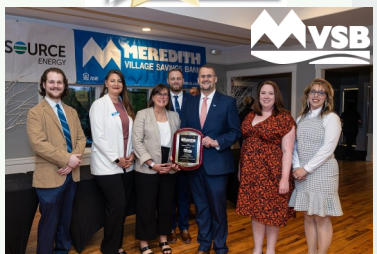
Meredith Village Savings Bank